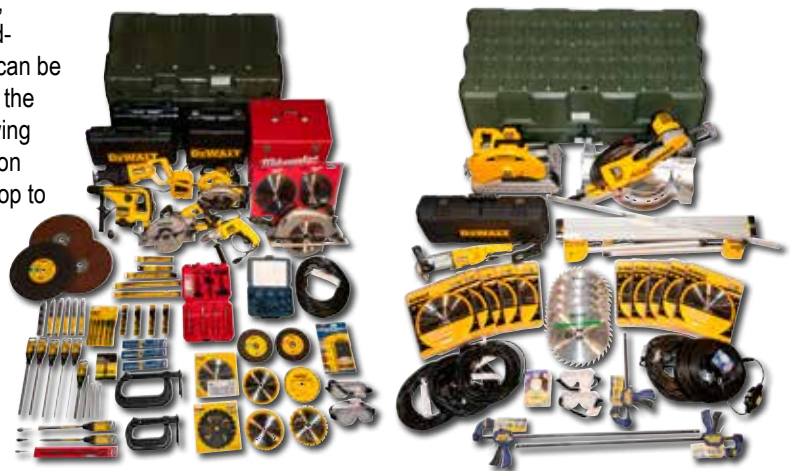
TABLE SAW & ROUTER TOOL KIT

The Kipper Table Saw & Router Tool Set provides specific tools, common to the complete carpenter shop set, to supplement additional carpentry teams in modular fashion. Carpenter teams can be deployed with this Tool Set without impacting the capabilities of the parent unit and accomplish finish carpentry tasks with greater levels of accuracy and higher production rates. This Tool Set is used to support a fabrication shop - making repetitive, accurate cuts and intricate cuts; and also trims, moldings, and other piecemeal work of both a functional and ornamental nature.