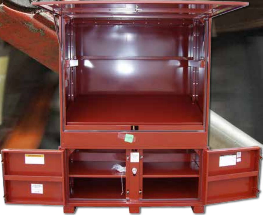
Field Office Site Box Cubic Feet: 192 - Weight: 713